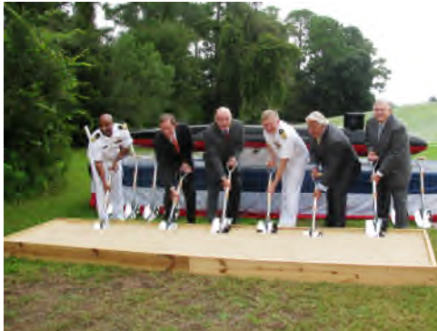
Navy, Georgia Power officials and Commissioners turn first dirt at groundbreaking