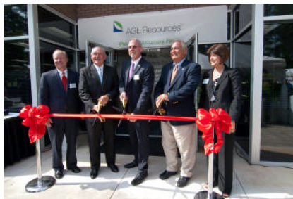
Commissioner McDonald joins Governor Sonny Perdue and AGL officials at the Customer Care Center ribbon cutting