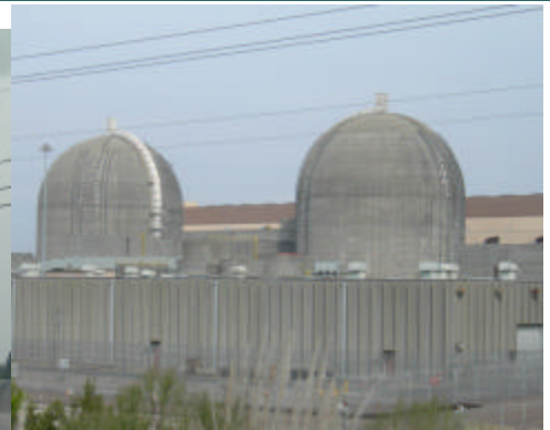
The two reactor containment buildings at Plant Vogtle