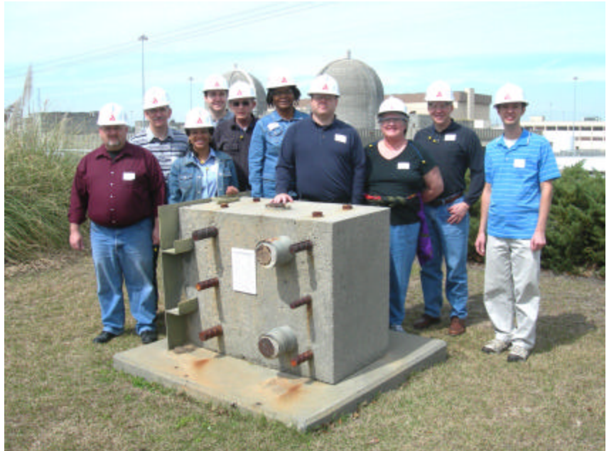
Staff in front of a cross section of the reactor containment walls.

Fourteen Commission staff members visited the Alvin W. Vogtle Electric Generating Plant March 14 in Waynesboro, Georgia to get a close look at one of the two nuclear power electric generating facilities in Georgia. The plant is operated by Southern Nuclear Services Company and is co-owned by Georgia Power, Oglethorpe Electric Generating, Dalton Utilities and the Municipal Electric Authority of Georgia. The staff visited the reactor control room, the turbine generator room and then took a driving tour around the facility. Plant Vogtle has been in operation since 1987 when Unit 1 went on line. Unit 2 went on line in 1989.