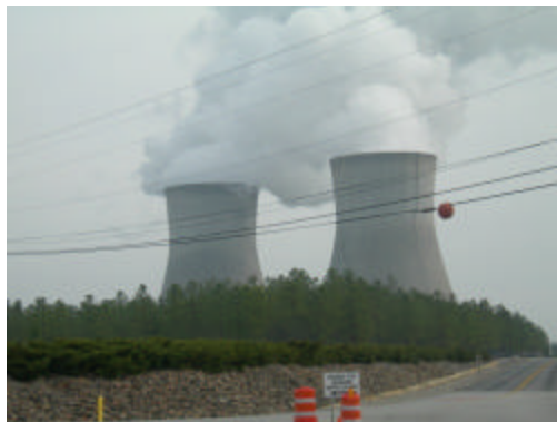
The 540 foot tall cooling towers at Plant Vogtle

Georgia Power is currently evaluating bids for its 2016 power generation needs. Southern Company signed an agreement April 8 with Westinghouse Electric to design and build two new nuclear units at the Plant Vogtle site. Georgia Power will submit the nuclear bid on May 1. The Commission would conduct hearings in late 2008 or early 2009.