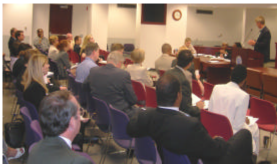
AGL, natural gas marketers and Commission staff discuss consumer education