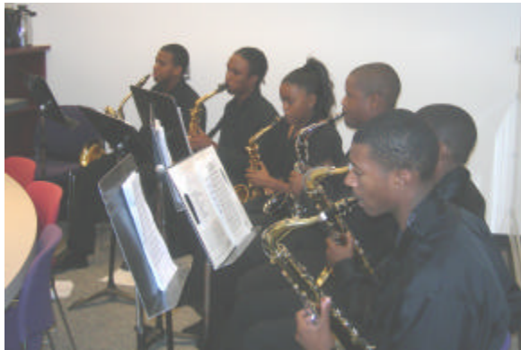
MLK High School Saxophone Choir provided musical entertainment