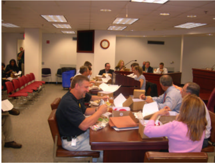
Commission staff enjoys lunch following Employee Recognition Day