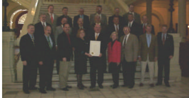
tion designating May as "Dig Safely Month."

Governor Sonny Perdue joined with representatives from the Commission, Utilities Protection Center, utilities, cities, counties, excavators and locators to issue a proclama-