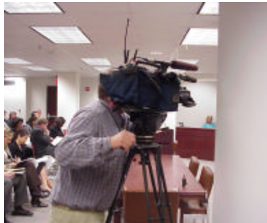
News Media Covers AGL Decision