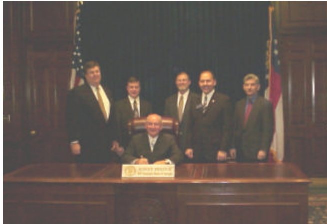
Commissioner Stan Wise, Jim Bottone, Danny McGriff, Senator Seabaugh and Bill Edge join Governor Perdue for the bill signing

Governor Sonny Perdue signed into law May 9 Senate Bill 274 which revises the Georgia Utility Facility Protection Act (GUFPA). The bill cleared its final hurdle on the last day of the 2005 General Assembly. Senator Mitch Seabaugh (R-Sharpsburg) sponsored the measure. One of the key points of the measure is that for the first time local governments and authorities are subject to fines and penalties levied by the Commission although the fines have caps both on a per violation and an annual basis. The legislation limits fines on