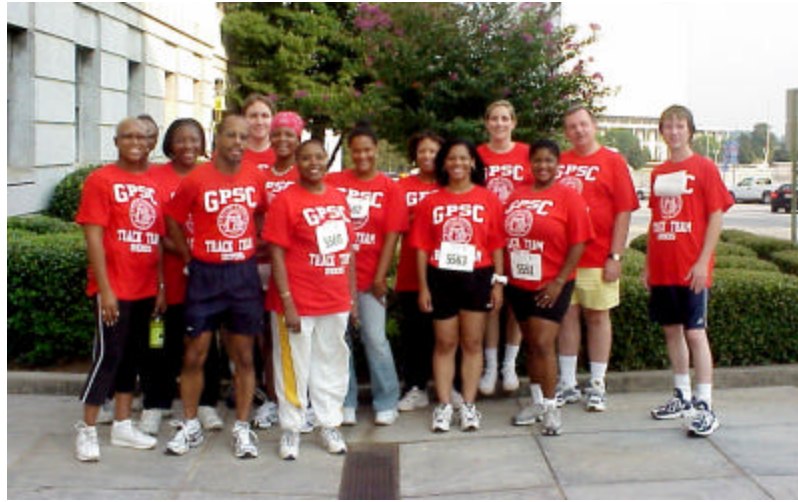
The Regulators pose for a pre-race photo before heading down to Turner Field.