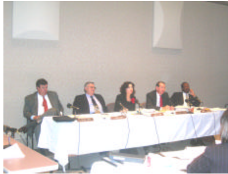
Commissioners hear Atmos Rate Case at Brenau University in Gainesville

The Commission headed east, south and north during September, October and November to hold hearings in the Atmos Energy base rate case and the Savannah Electric fuel cost rate cases. Commissioners held two days of hearings September 7 and 8 in Columbus to kick off the hearings on Atmos Energy's request for an increase in its base rates. The hearings were held at the Elizabeth Bradley Turner Center at Columbus State University. The local news media, Columbus Ledger Enquirer, WRBL-TV and WTVM-TV also covered the hearings.