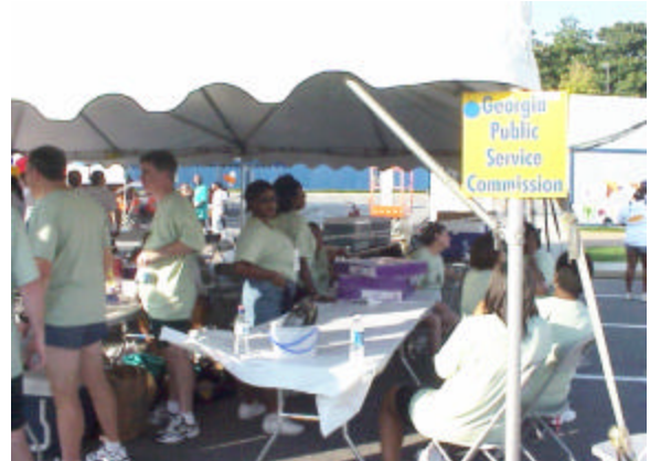
Race Participants enjoy food and fellowship under the PSC tent following strenuous race