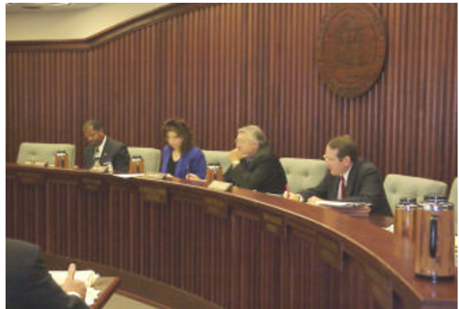
Commissioners journey to Savannah to listen to testimony in the Savannah Fuel Case

The Commissioners included in the fuel rate the cost of the Plant/McIntosh Plant Kraft coal Transloader over